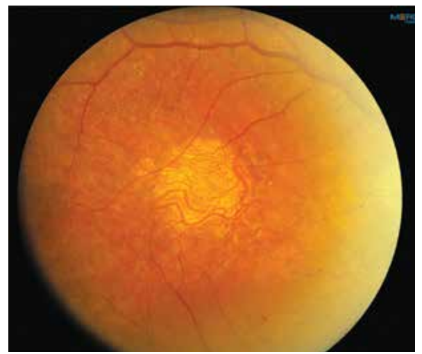
Examples of geographic atrophy lesions with visible choroidal blood vessels (yellow spots). These lesions correspond to blind spots in the patient's vision.